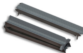
Ramp and crossing rail (foldable) (Art. 19950)