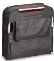
Transport and storage bag (Art. 19840)